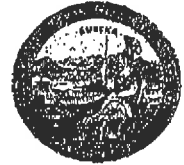
EDMUND G. BROWN JR. Governor