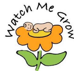
Watch Me Grow Demonstration Site