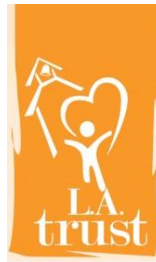
The L.A. Trust