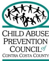
Child Abuse Prevention Council of Contra Costa County