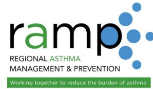
Regional Asthma Management & Prevention