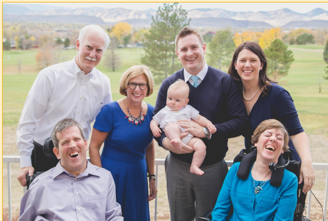
The Blakely Family